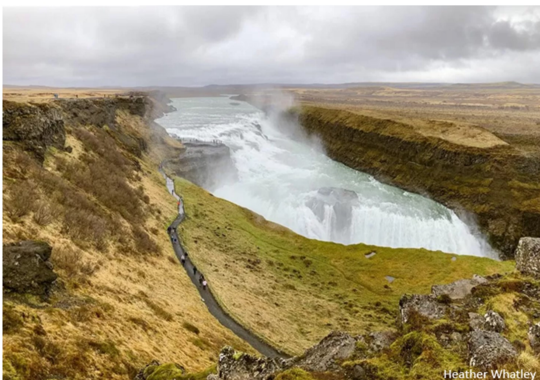
The very powerful Gullfoss waterfall in Iceland